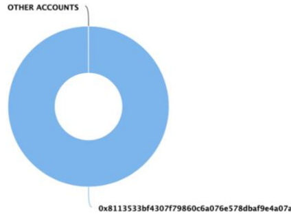
Crypto Classic Top 100 Token Holders

(A total of 100,000,000.00 tokens held by the top 100 accounts from the total supply of 100,000,000.00 token)